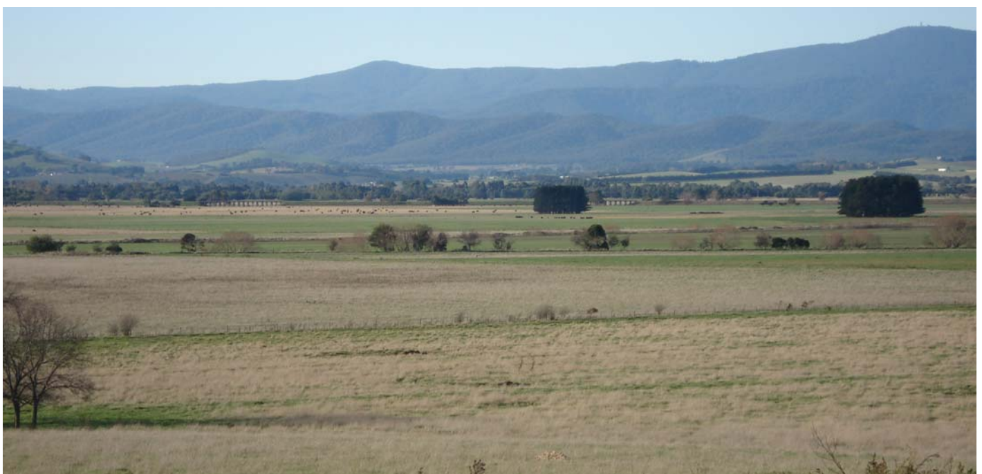
Views of the Yarra Valley.