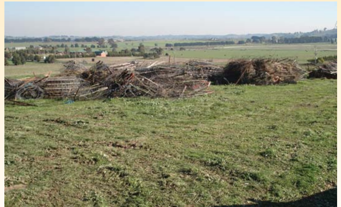
Fences removed as part of the site preparation at Coowerp.

Once completed the Brief will be expressed in the internal design allowing for maximum functionality. The final design will be displayed for members as soon as it is completed.