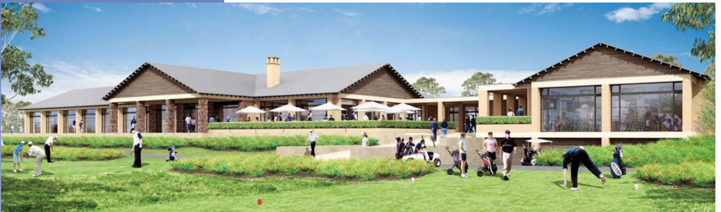
A computer generated impression of the new clubhouse supplied by Scharpe Design.