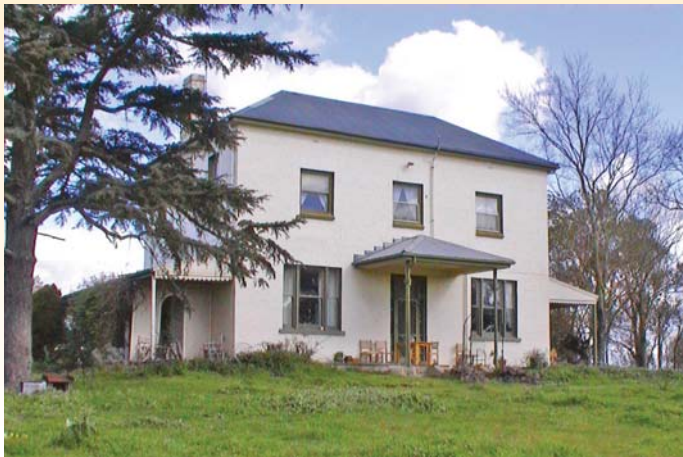
Coowerp Homestead at Yering. The homestead was built in the 1800s.