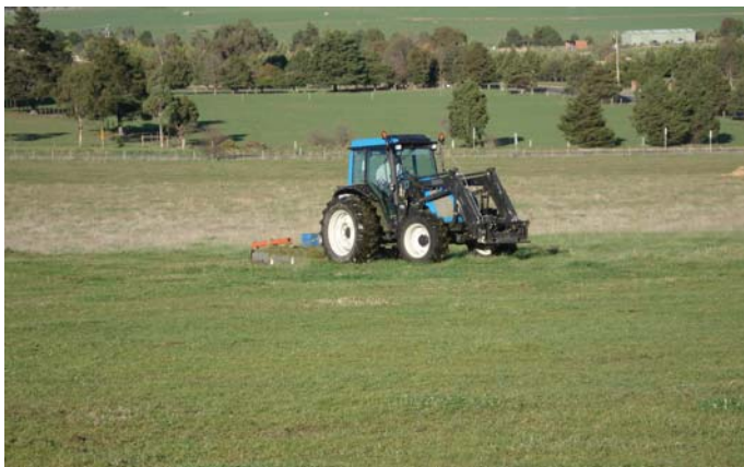
Paddock slashing at Coowerp.